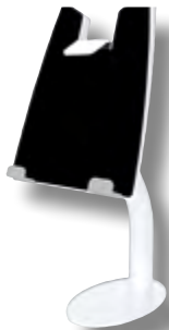
Mod. SM1807 Stand and mount sits on tabletop.