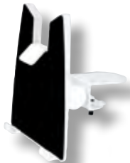
Mod. SMH0237 Mount attaches to edge of the tabletop

Compatible with Tablet, iPad, eBook readers and devices from 9.7" to 13", are available in different versions to meet any requirement.