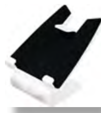
Mod. SMH0238 Stand sits on tabletop or attaches to wall