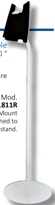
Mod. SM1811R Mount attached to floor stand.