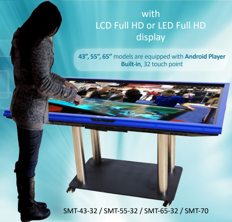
SMT-43-32 / SMT-55-32 / SMT-65-32 / SMT-70