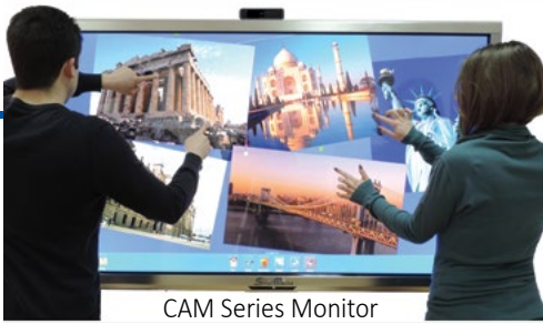
CAM Series Monitor